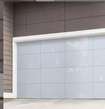
Design Orion single border dark tinty wndows