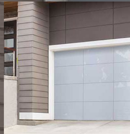
Slat door with x design in white