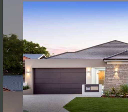
Onyx - Orion Composite door